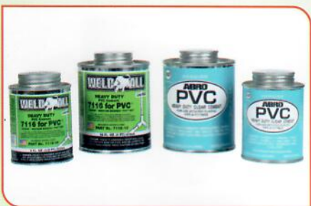
PVC Solvent Cement - Clear 8 oz - 16 oz