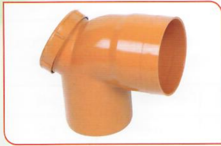
Cleanout Elbow 90° 110mm