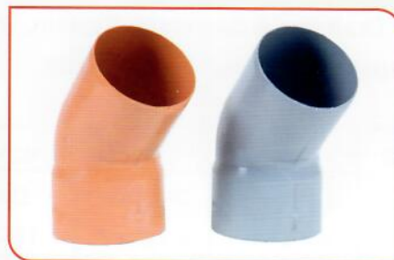
Elbow 45° - One Side Socket 50mm - 75mm - 110mm - 160mm