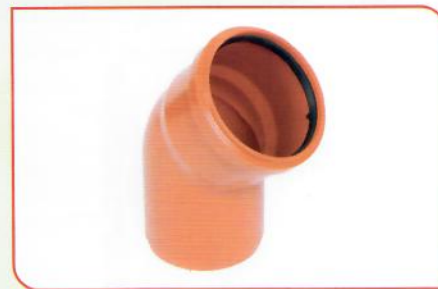
Elbow 45° RR 110mm - 160mm - 200mm - 250mm