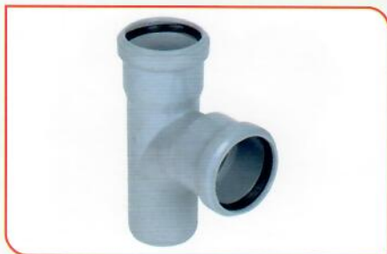
Tee Y 90° RR 50mm - 75mm