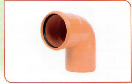
Elbow 90° RR 110mm - 160mm - 200mm - 250mm