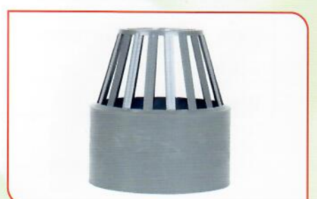
Air Vent Cowl 75mm - 110mm - 160mm