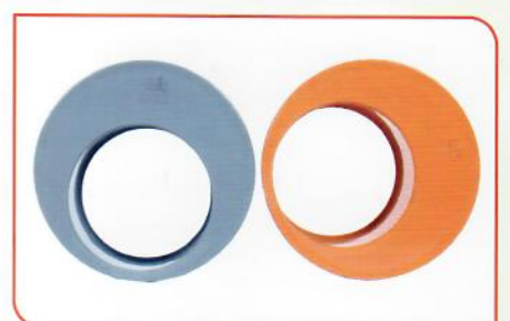
Reducing Bush 110 x 50mm - 110 x 63mm 110 x 75mm x 160 x 110mm