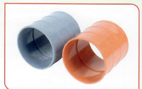
Coupler 50mm - 75mm - 110mm - 160mm - 200mm