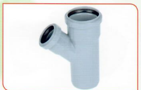
Reducing Tee Y 45° RR 75 X 50mm - 110 x 50mm 110 x 75mm