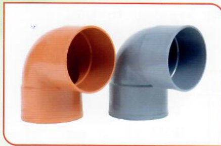
Elbow 90° - 2 Side Socketed 50mm - 75mm - 110mm - 160mm

Pipe Fittings as per DIN 19531, 19534 & 8062 , EN / BS EN 1329 / 1401 / BS 4660