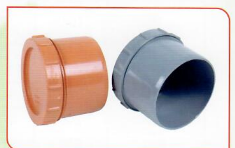
Cleanout Plug 50mm - 75mm - 110mm - 160mm