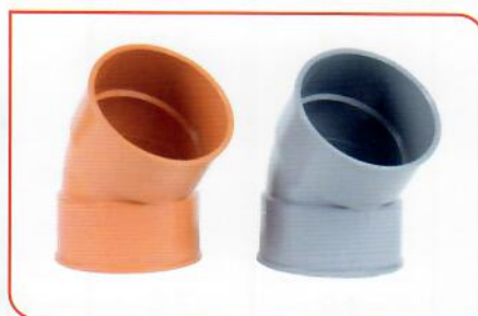
Elbow 45° - 2 Side Socketed 50mm - 75mm - 110mm - 160mm