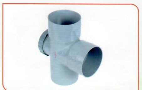
Cleanout Tee 90° 110mm