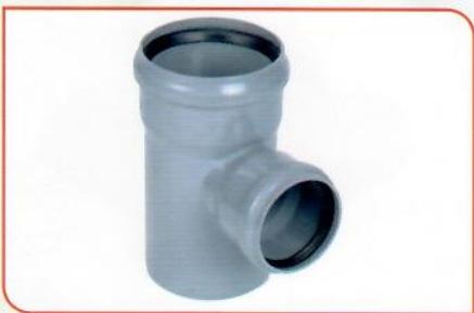
Reducing Tee 90° RR 75 x 50mm - 110 x 50mm - 110 x 75mm