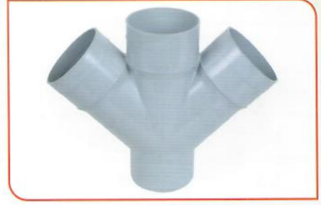
Double 45° - WYE 110mm