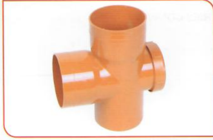
Cleanout Tee 90° 110mm