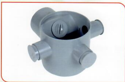
Floor Trap 110 x 75 x 50mm - 160 x 110 x 50mm