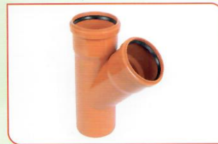
Tee Y 90° RR 110mm - 160mm - 200mm - 250mm