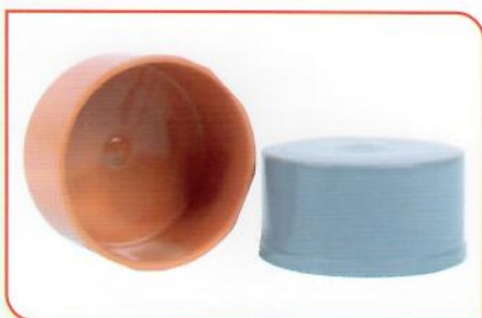
End Cap 50mm - 75mm - 110mm - 160mm