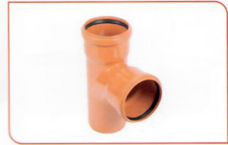
Tee 90° RR 110mm - 160mm - 200mm - 250mm