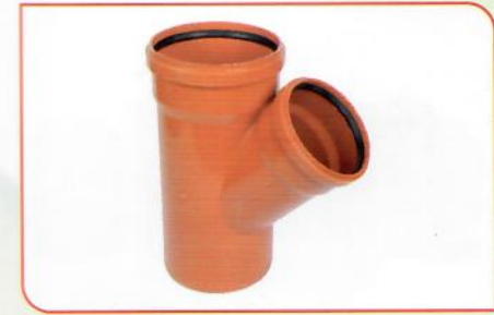
Reducing Tee Y RR 160 x 110mm - 200 x 160mm 250 x 200mm