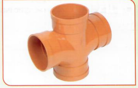
Cross Tee 90° - 4 Way 110mm