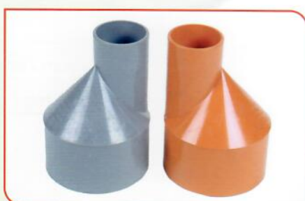
Reducing Socket 110 x 50mm - 110 x 75mm