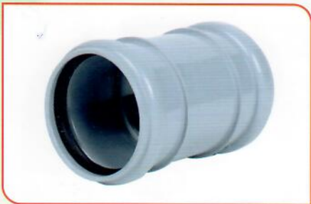
Coupler RR 50mm - 75mm