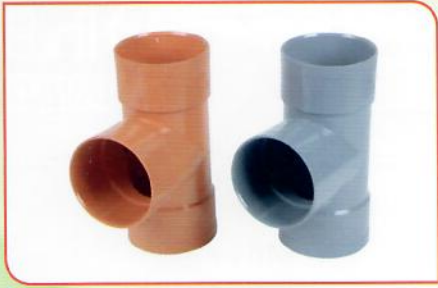
Tee 90° 50mm - 75mm - 110mm - 160mm