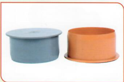
Socket Plug 50mm - 75mm - 110mm 160mm - 200mm