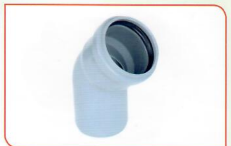
Elbow 45° RR 50mm - 75mm