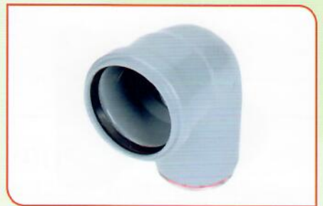
Elbow 90° RR 50mm - 75mm