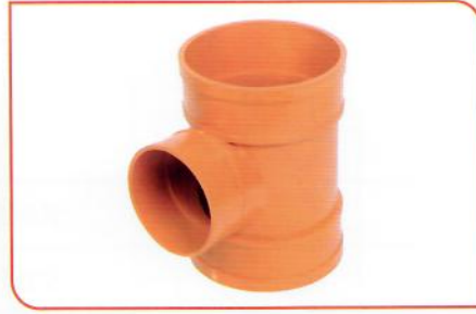
Reducing Tee 90° 110 x 50mm - 110 x 75mm - 160 x 110mm