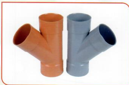
Tee "Y" 45° 50mm - 75mm - 110mm - 160mm