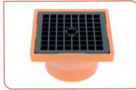
Roof Drain 110mm