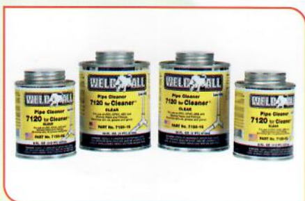
PVC Cleaner Clear 8 oz - 16 oz