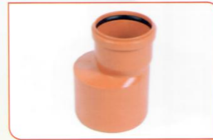
Reducing Coupler RR 160 x 110mm - 200 x 160mm