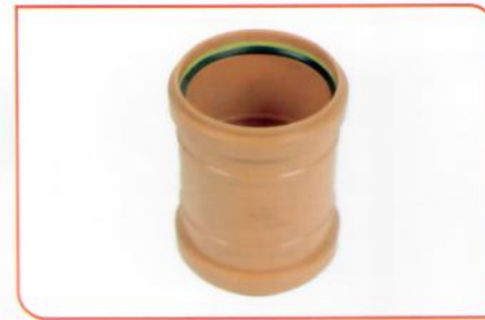
Coupler RR 110mm - 160mm - 200mm - 250mm