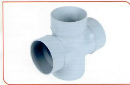
Cross Tee 90° 4 Way 110mm