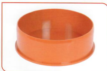
Socket Plug 110mm - 160mm - 200mm