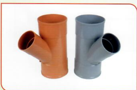
Reducing Tee Y 45° 75mm x 50mm - 110mm x 50mm 110 x 75mm - 160mm x 110mm