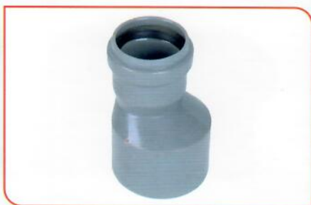
Reducing Coupler RR 75 x 50mm - 110 x 50mm - 110 x 75mm