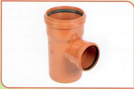
Reducing Tee 90° RR 160 x 110mm - 200 x 160mm 250 x 200mm