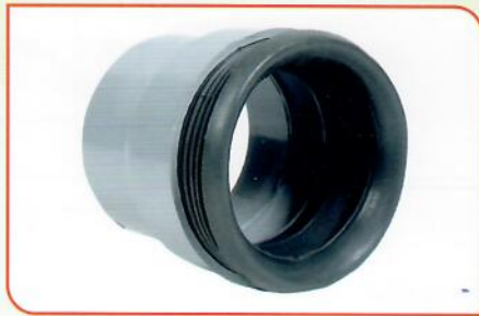
Funt Connector 110mm - 125mm